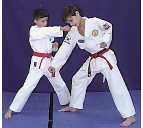
4. Make a right punch to the side of the face.