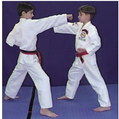
4. Make a right front punch to the face.