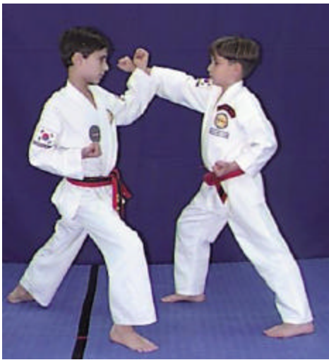
1. Right foot step making a front stance and execute a left inner forearm block.