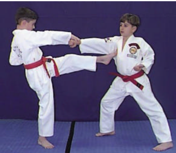
3. Pull opponent forward into a left front snap kick.