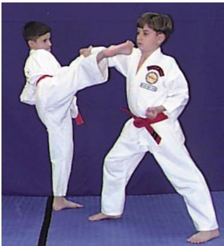
5. Execute a right front round house kick to the head or chest.