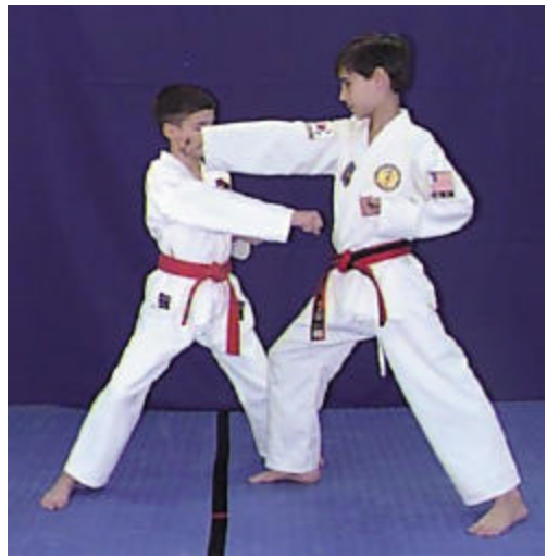
2. Make a right punch to the kidney.