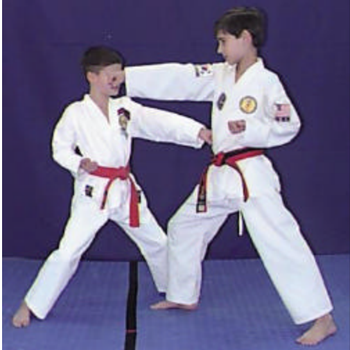
3. Make a left punch to the kidney.