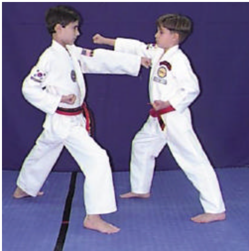
3. Make a left reverse punch to the solar plexus.