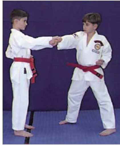
2. Grab the wrist .