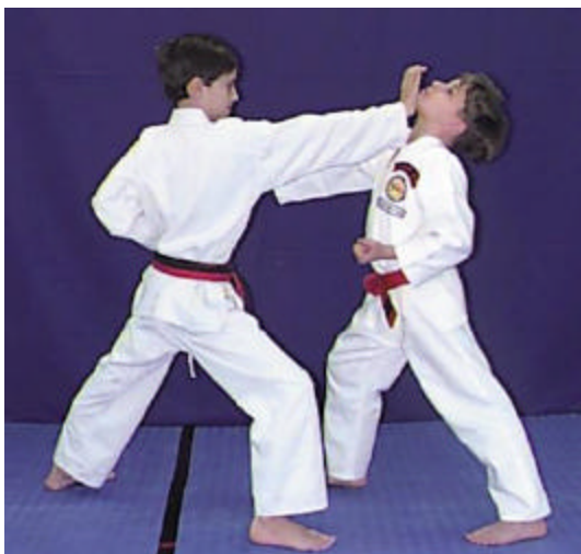
4. Make a right palm strike to the chin.