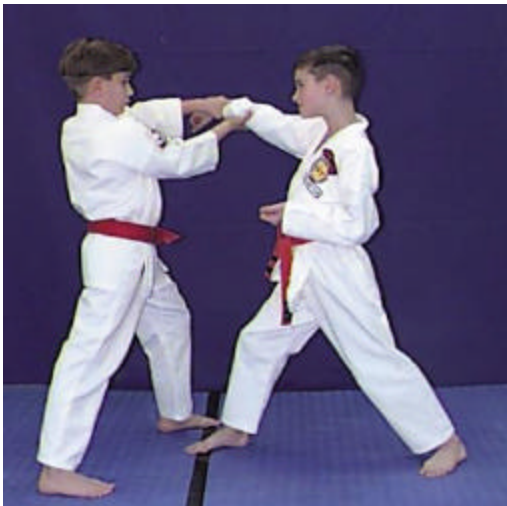
3. Grab the wrist with both hands and step under the arm to pin opponent's arm behind his back.