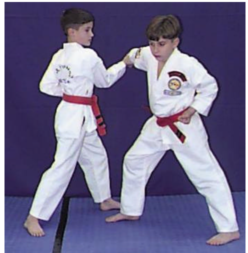
4. Twist the arm to the left opening up the opponent's torso.