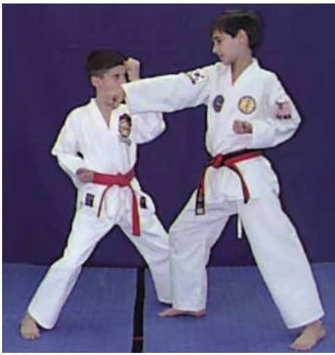
1. Step to the left making a riding stance and left front block.