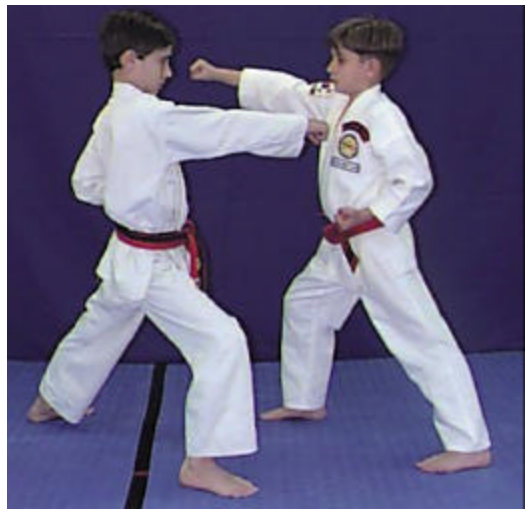
2. Make a right front punch to the solar plexus.