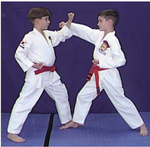
1. Step forward with the left foot making a front stance and left side block.