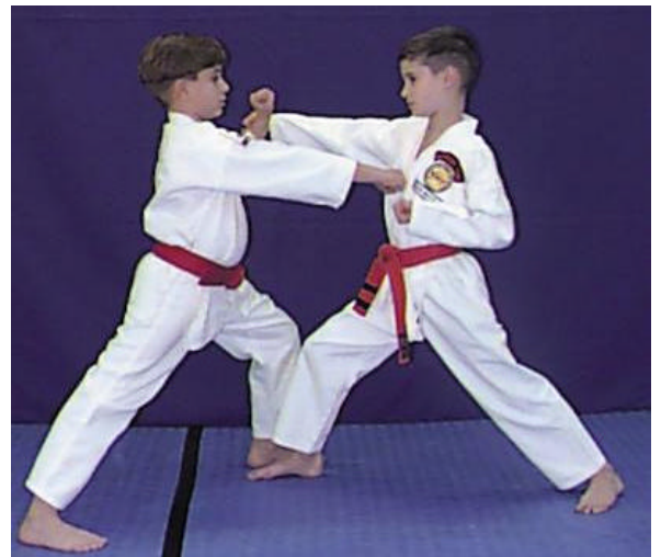
2. Make a right reverse punch to the solar plexus.