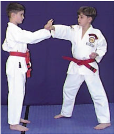
1. From ready position, make a right knife hand side block.