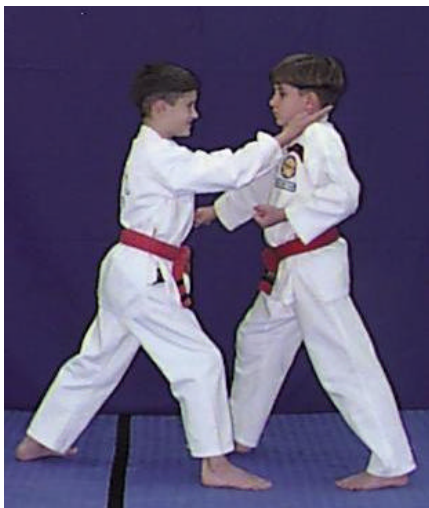
3. Execute a twin knife hand strike to the collar bone.