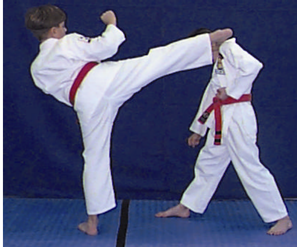
3. Rechamber the right leg and make a high section front round house kick.