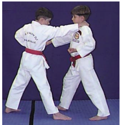
4. Grab the shoulder with the right hand.