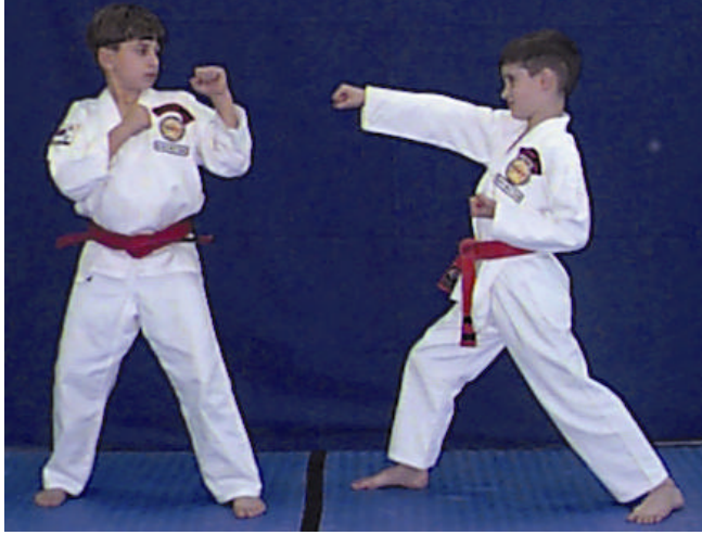
1. Step back with right foot making a back stance.