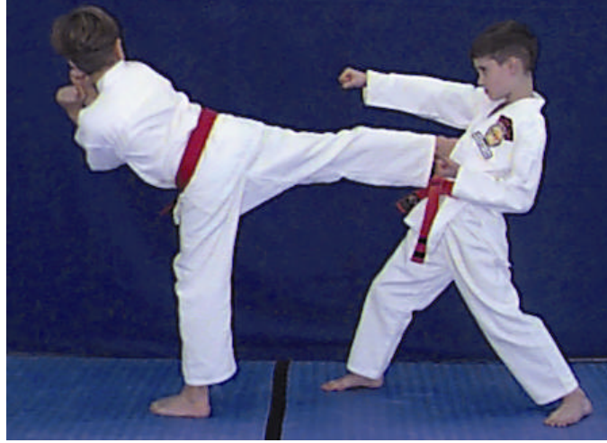
2. Spin clockwise making a middle section right back kick.