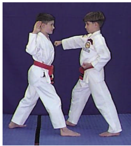
2. Pull both hands back into a chamber for twin knife hand striking.