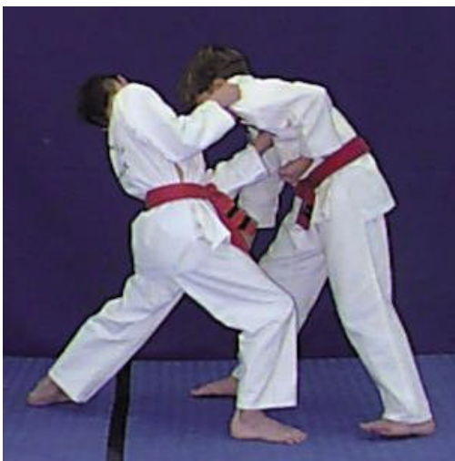
5. Pull the opponent into a left upper punch.