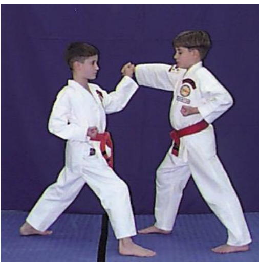
1. Step in with the right foot making a front stance and execute a left side block.